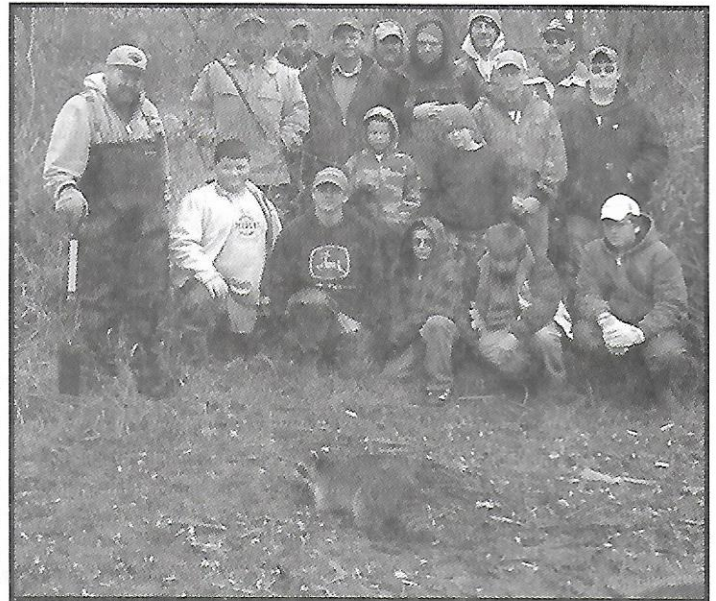
The water trapping group, and success!

ISTA provided many giveaways, including free traps, free trapping lure, free trapping books, and free trapping magazines for all trappers who attend-