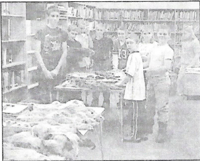
Students take time during a break to make a closer inspection of the furs.

staff assisted during the course. This was a big help.